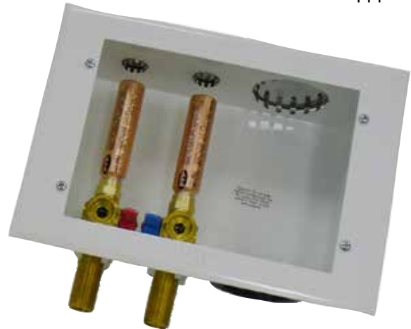
Metal Laundry Box MM-500MLB

Boxes are supplied with water hammer arrestors and quarter turn valves. Boxes include necessary mounting brackets and faceplate. Metal boxes include a 2" rubber drain pipe coupling and are constructed of 20 gauge steel with a white powder coat. (Note: Box dimensions may vary slightly from drawings).