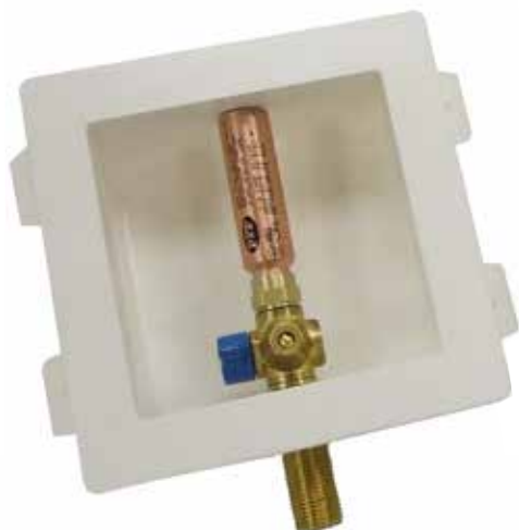
Plastic Ice Maker Box MM-500PIMB