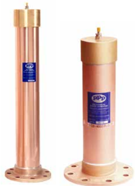
BLUE LINE CLASS 150